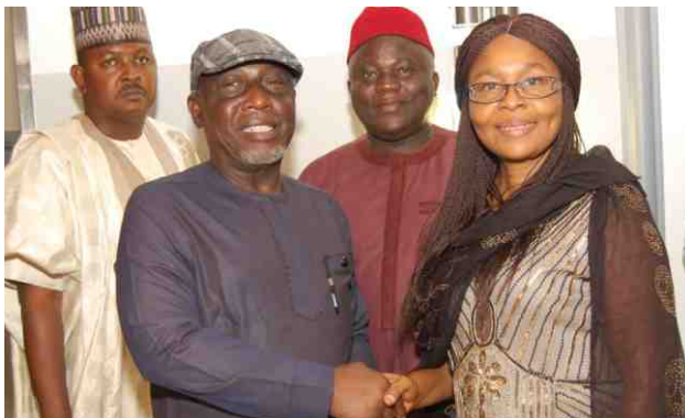
Amb. Ifeoma with distinguish Senator Abba Moro