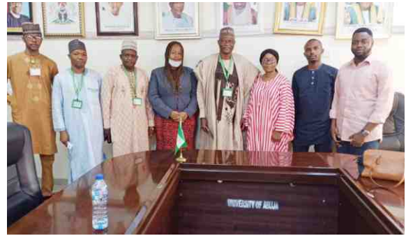
USLACC staff meet with the Vice Chancellor of Abuja university