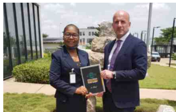
Visit to the High Commissioner, Embassy of Canada in Abuja