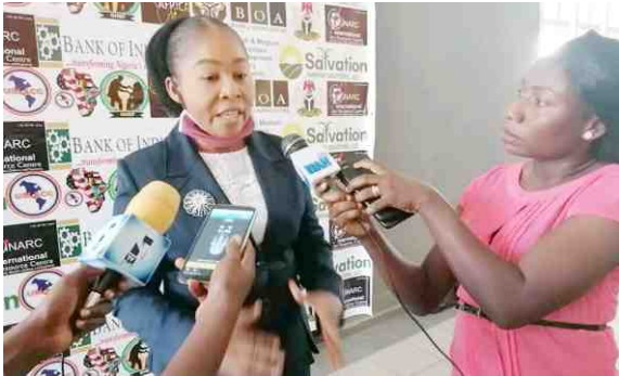
Press interview at a business development event (MEEGA)