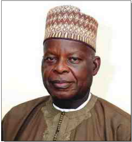
CHIEF SIR MIKE MBAMA OKIRO Former Inspector General of Police, Nigeria / Chairman BOP