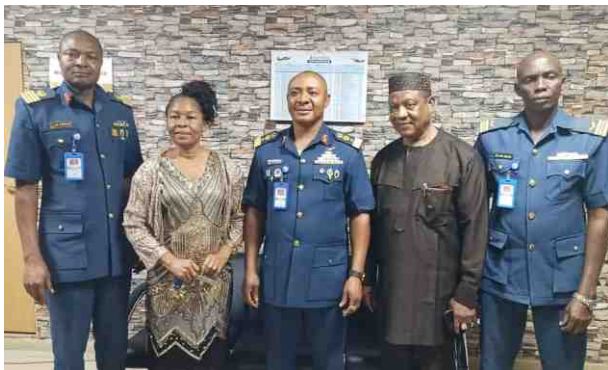
Meeting with some of the executives of the Nigeria Air force, Abuja