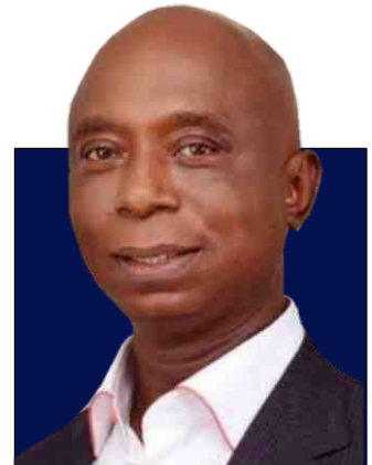
SEN. PRINCE NED NWOKE Rep. Delta North Senatorial District