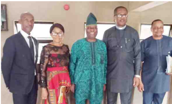
Visit to the Rector of Nekede Polytechnic, Imo state Nigeria