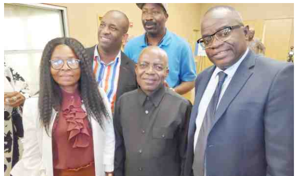
Meeting with the Governor of Abia State in the USA