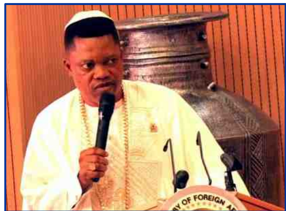
Archbishop Kingsley Uyoata