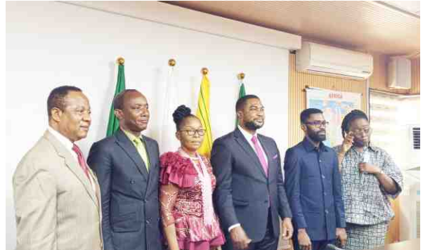
Courtesy visit to the ministry of Foreign Affairs, Abuja-Nigeria