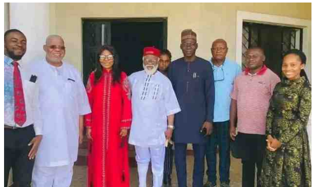
Some of USLACC Africa Executives in Nigeria