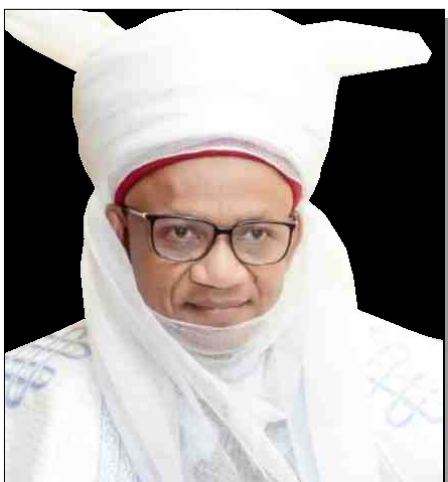
HRH, ETSU NUPE ALH (DR.) YAHAYA ABUBAKAR The King of Nupe