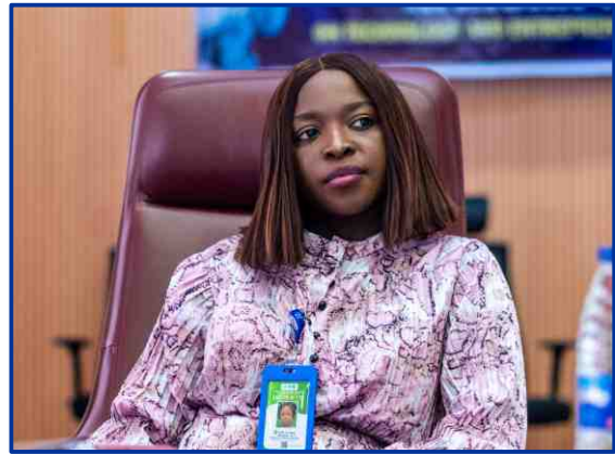
Amb. Lazarus Roseline