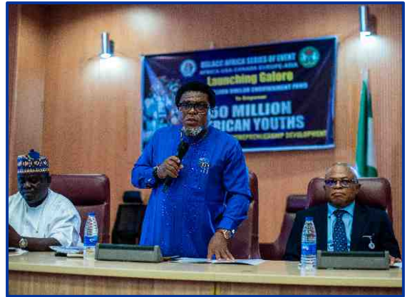
The Chairman of Occasion giving the opening remark